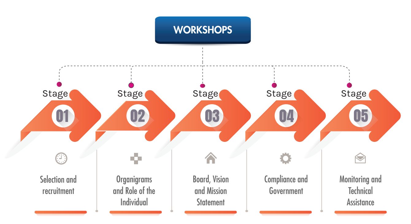
FIGURE 3 CAPACITY BUILDING PROCESS COMPONENTS

Mentor offices cascade the training received and offer additional forms of support to their respective mentees within the Hub network. The mentee workshops are aimed at enhancing CAO governance and compliance, thus making them better able to receive, manage and account for funds. Components of this process are outlined in Figure 3.