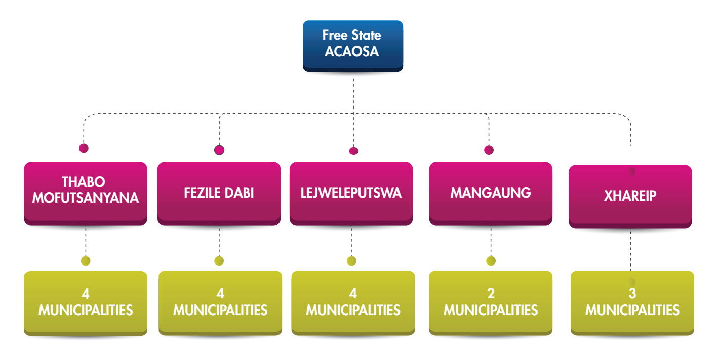
Figure 1 Hub Model Structure: Districts and Municipalities

The Hub is funded through the Multi-Agency Grant Initiative (MAGI), a multi-donor funding mechanism managed by HIDSA. The MAGI programme aims to strengthen community based organisations (CBOs) to better serve the needs of communities through a multi-pronged approach encompassing catalytic funding, capacity building and networking.