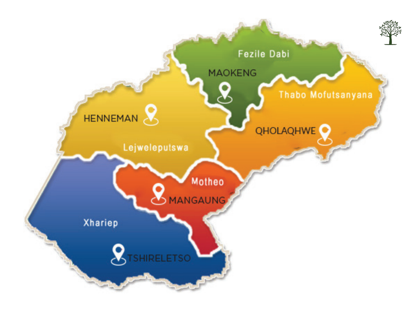
Figure 2 Map of District (Hub) Offices

NB: The Hub office in Xhariep is no longer function due to operational funding challenges